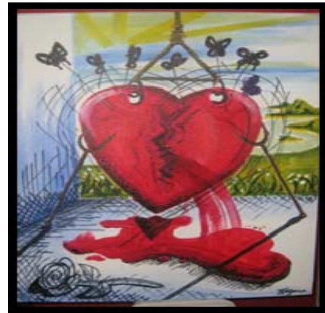
Paintings by Tim Glazema, 2008 'Yesterday Today Tomorrow'